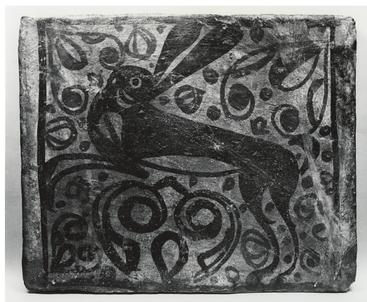
15th C Spanish ceiling tile with a hare symbolizing hunting.

Pop-ups collapsed, we will need replacements. This is the reason we will be looking at making a sun shade for the shire. Bring any suggestions to the September or October moot for size, material, and shape of the sun shade.